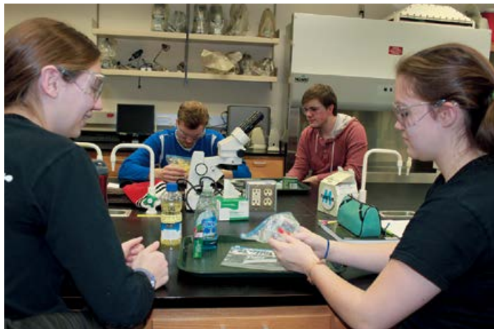
Students in teaching laboratory class

In 1998 I joined the department faculty as the director of biology teacher education. My previous experience as a liaison between St. Louis-area K-12 teachers and Washington