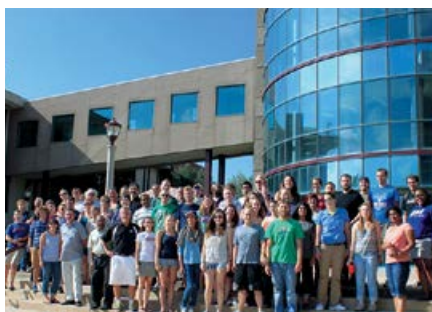
Our faculty and graduate students fall 2013