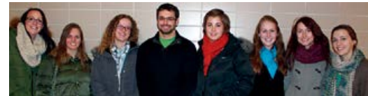
Some of the recent Weigel grant recipients

More information about each of the funds can be found by clicking on the "Make A Gift" button at bio.IllinoisState.edu .