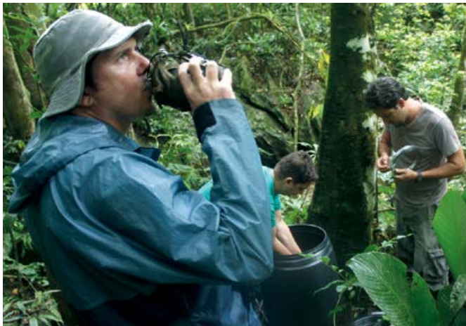
Collaborators in Brazil set up a mosquito experiment.

To an ecologist, any organism can embody multiple fascinating aspects of natural history, a legion of unanswered questions about its adaptations to its environments, the ebb and flow