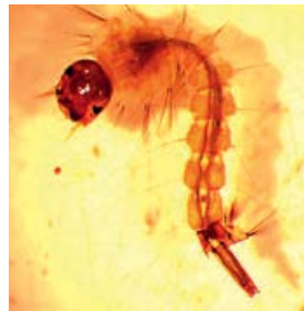
Mosquito at larvae stage

The work in the Midwest, at the Tyson Research Center of Washington University in St. Louis, is funded by a grant from the National Institutes of Health. The parallel work in Brazil is done in collaboration with investigators and students at Universidad Federal de Viçosa and Universidad Federal de Florianopolis, and is funded by a grant from the Brazilian government's Science Without Borders Program, which has as its goal the fostering of greater scientific collaboration between scientists from Brazil and the United States. The Brazilian project will